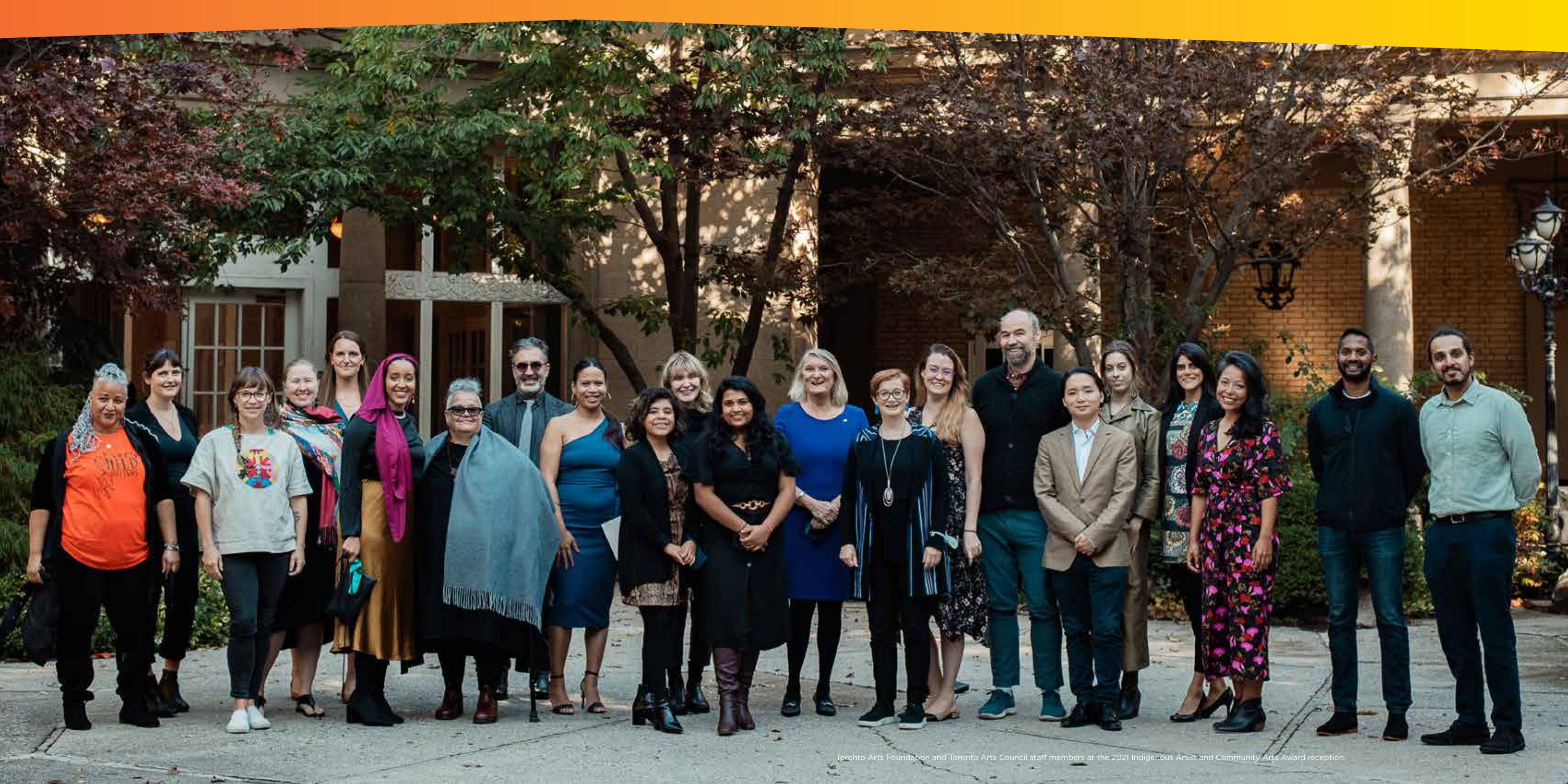
Toronto Arts Foundation and Toronto Arts Council staff members at the 2021 Indigenous Artist and Community Arts Award reception.