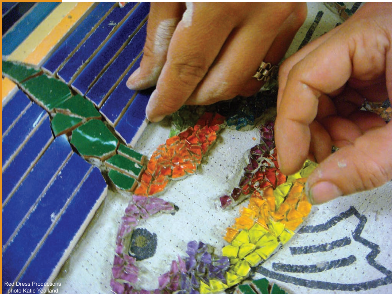
Red Dress Productions