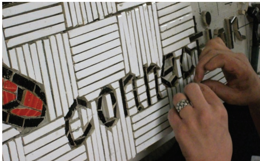
Workshop at Sherbourne Health Centre, Red Dress Productions