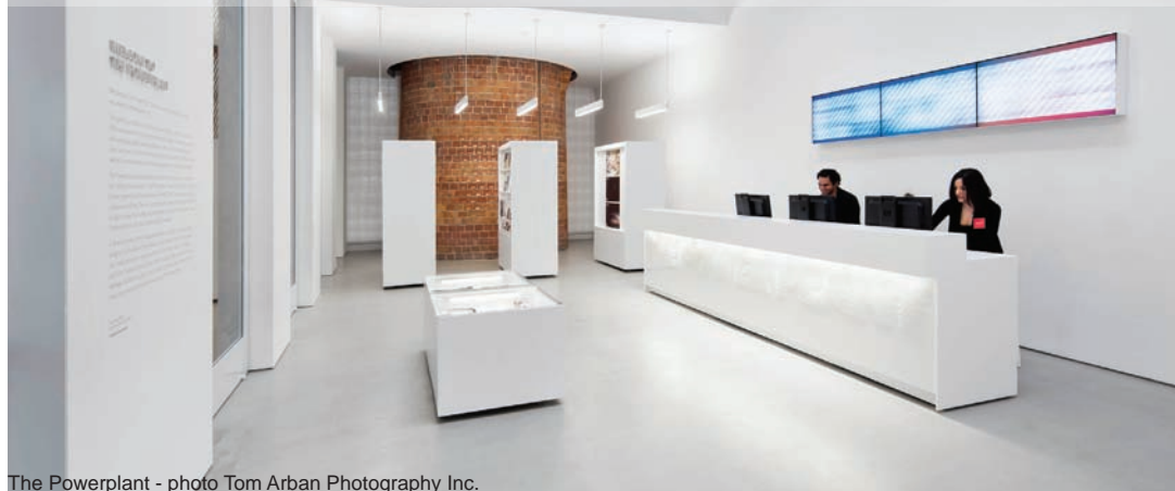
The Powerplant