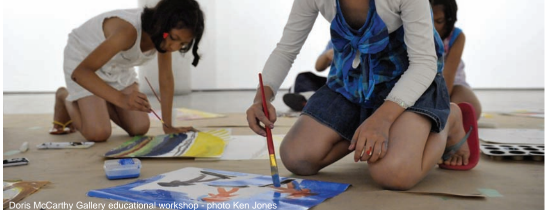
Doris McCarthy Gallery educational workshop