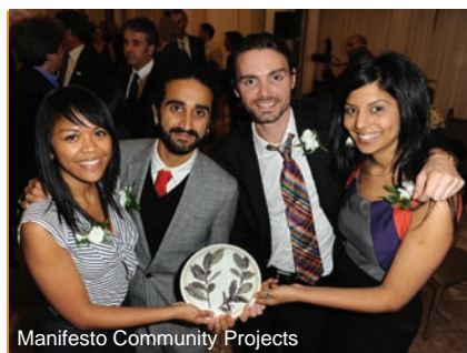
Manifesto Community Projects