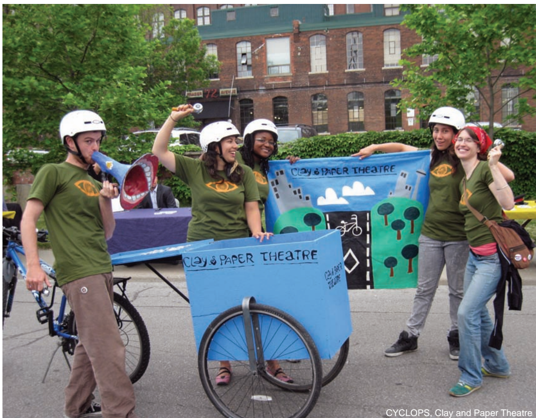
CYCLOPS, Clay and Paper Theatre