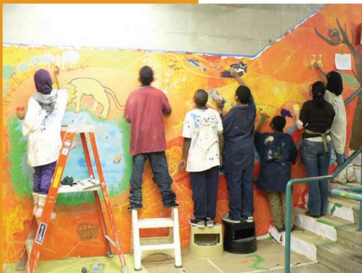
York U. volunteer assists at Inner City Angels and Mariposa in the Schools program