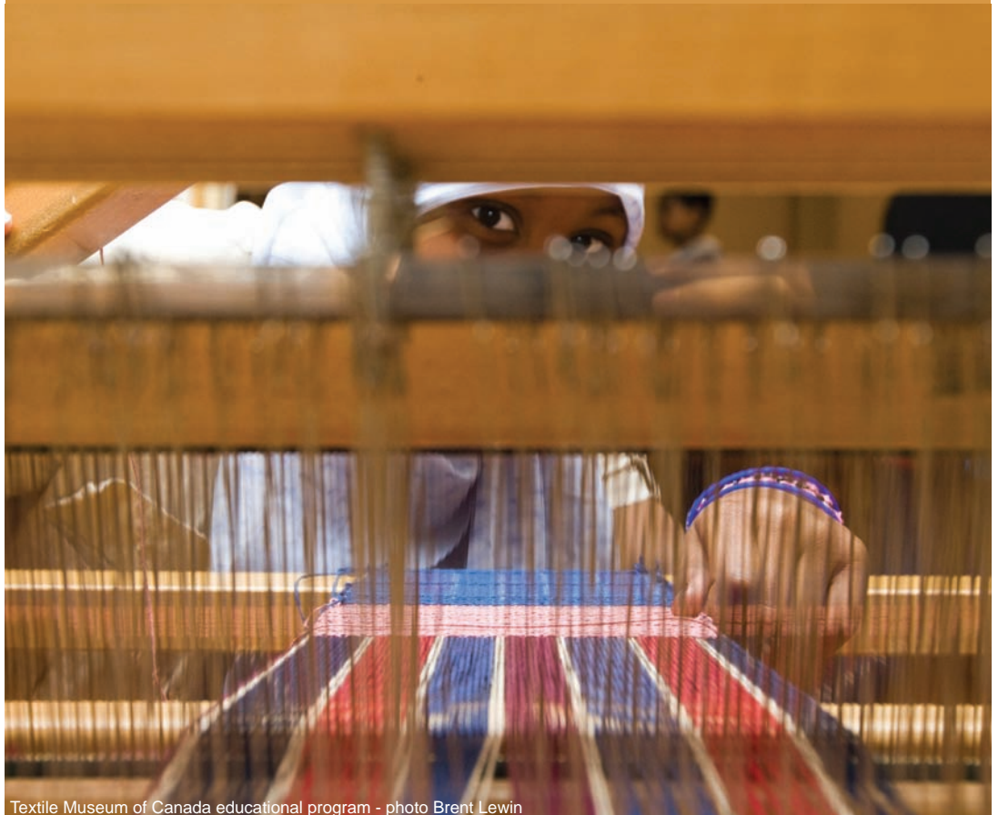
Textile Museum of Canada educational program

At Toronto Arts Foundation, we believe that a great city demands great art, and by supporting, celebrating, financing and advocating for Toronto's local artists, we are improving the quality of life of all Torontonians. The Foundation is in a unique position to achieve its vision for a 'Creative City: Block By Block.' Toronto Arts Foundation has access to a wealth of information gathered by its partner organization, Toronto Arts Council, thereby increasing the Foundation's capacity to assess opportunities across the reaches of the City of Toronto and develop strategies to increase accessibility to the arts for all citizens.