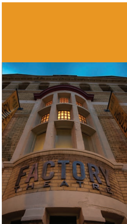
Factory Theatre

Chartered Accountants Licensed Public Accountants