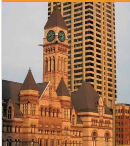
Old City Hall