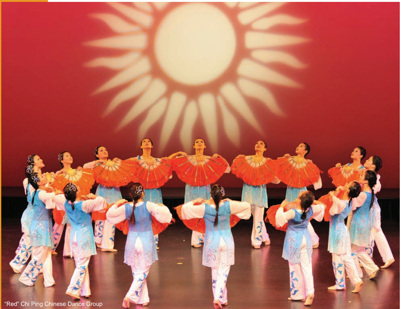
"Red" Chi Ping Chinese Dance Group