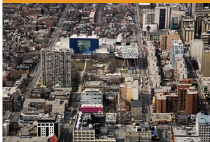
Toronto City