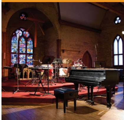
CCMC Music Gallery in St. George the Martyr Church