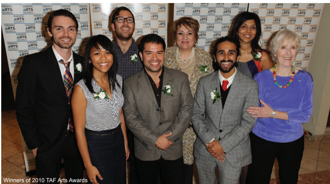
Winners of 2010 TAF Arts Awards