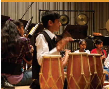
Composition project by Andrew Timar, Esprit Orchestra Creative Sparks program