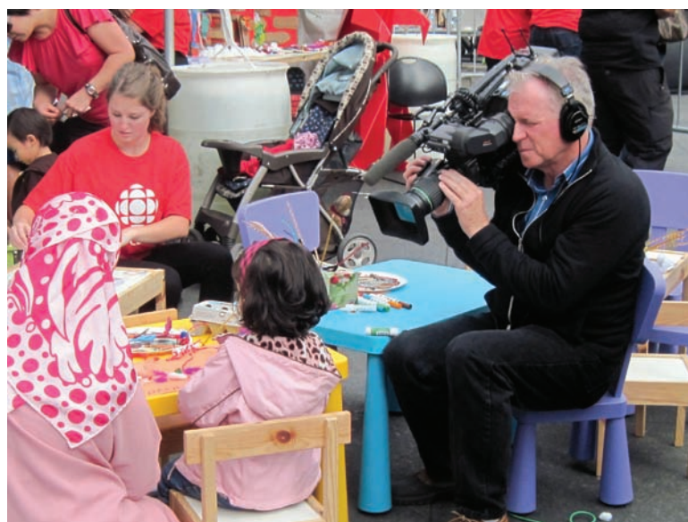
Volunteer for CBC assists at Culture Days launch